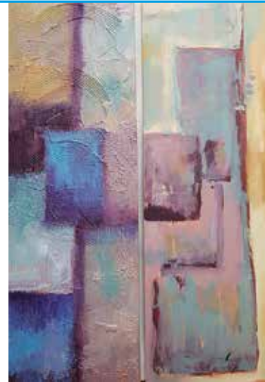
Leelah's , by Gregory size 1,20x0,40m (each). Price: USD 1,500