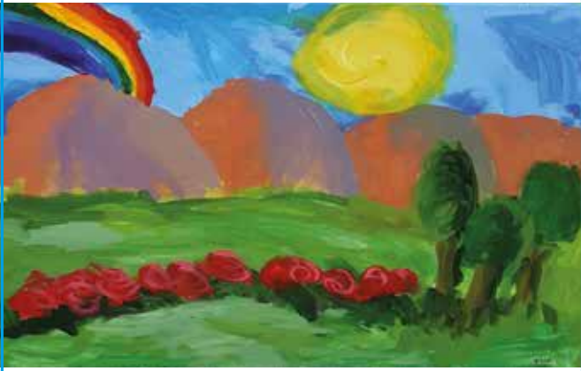
My Rainbow , by Elio size 0,60x0,90m. Price: USD 2,000