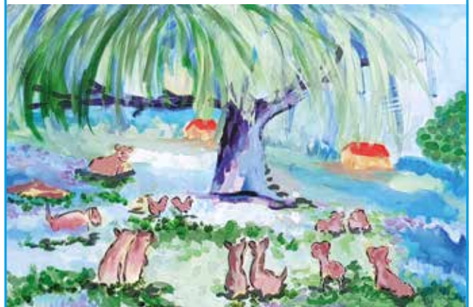
Lavender Sunset , by Emmanuel size 1,00x1,00m. Price: USD 3,000