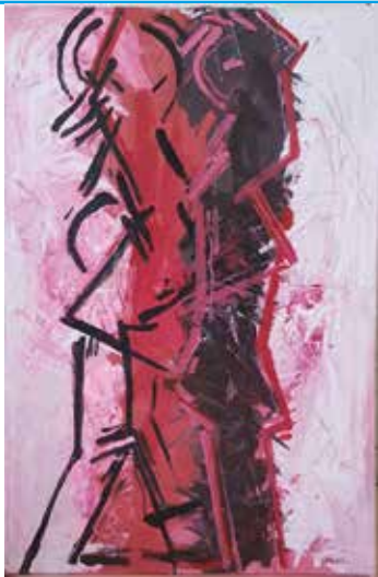
Roxane Tango , by Emmanuel size 0,90x0,60m. Price: USD 2,000