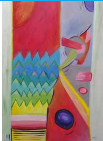
Peeking , by Ramy size 1,00x0,75m. Price: USD 2,000