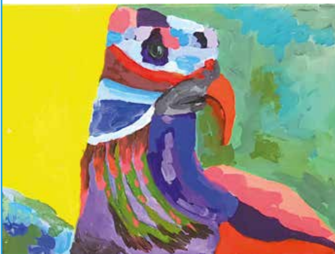
Magestic , by Walid size 0,30x0,40m. Price: USD 1,500