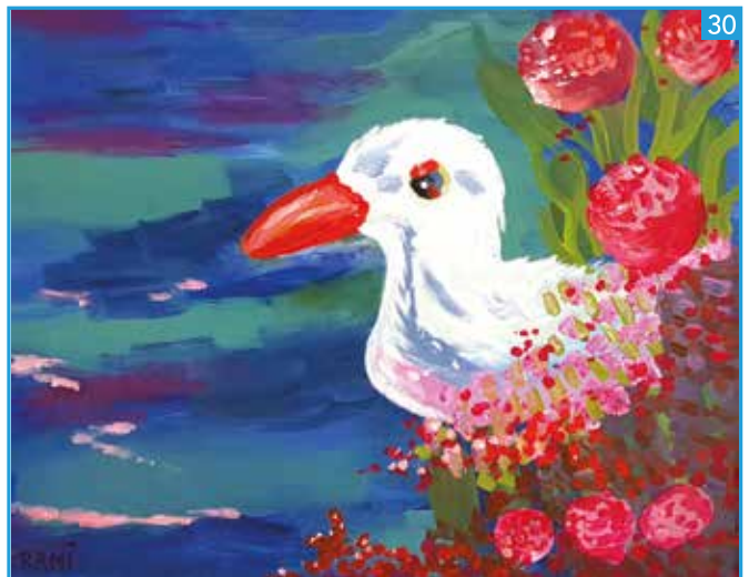
A La Mode , by Ramy size 0,40x0,50m. Price: USD 1,500